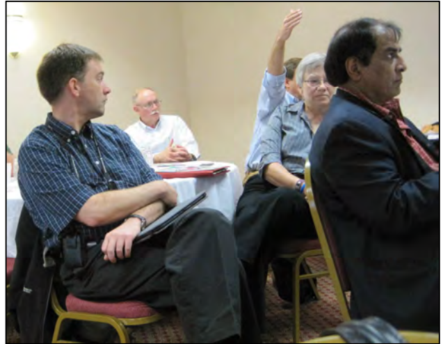
A good crowd of LEA members were in attendance at the World Dairy Expo meeting.